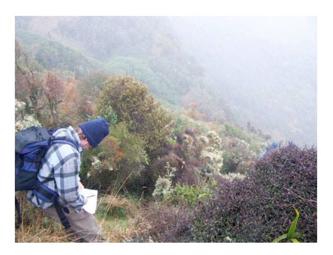
Bradley on the top of the steep, mist shrouded bluff.

Gunnera monoica on a wet bank was quite a contrast. After admiring the view to the sea and the basalt cliffs the viewing platform from we scrambled up through grassy tussocks to a rib of rock where there were amazing clumps of the local endemic, Helichrysum selago var tumidum. These were my favourite plants of the day, the dark green scales perfectly outlined in silvery white. With grumbling stomachs we then headed back to the car park to find a sheltered spot for lunch.