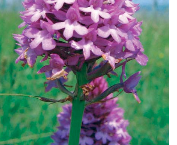
Orchis pyramidal ( Anacamptis pyramidalis ).

Due to its geology and geography, La encompasses Solutré Roche de different climatic zones: continental Mediterranean. and mediterraneo-mountainous; resulting in a rich and unique flora. Orchid species are diverse, but rare. Protected species of Solutré includes Orchis hommependu (Aceras anthropophorum), Loroglosse de à odeur bouc (Laroglossum hircinum) and Oeillet (Dianthus des chartreux carthusianorum). Viperine (Echium vulgare) is the most common vascular plant species and attracts a great diversity of insects. The Moro-sphinx (Macroglossum stellarum Hummingbird hawk moth) can often be observed feeding veraciously on