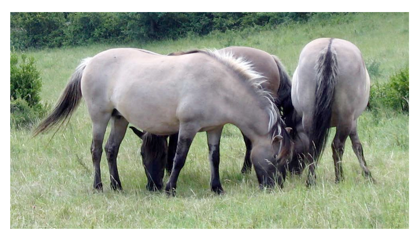
Konik Polski horses grazing the "pelouses calcicoles" at Solutré.

Chêne (Teucrium chamaedrys) can be seen. The delicate Petite primprenelle (Sanguisorba minor) is often present but discrete. In addition to a large collection of vascular plants from Solutré. the recently established botanical garden also presents native woody species, including Prunellier (Prunus spinosa), Groseiller à maquereaux (Ribes uva-crispa), Eglantier (Rosa canina), Cornouiller sanguin (Cornus sanguinea), Sureau noir (Sambuscus nigra), Cerisier de Sainte-Lucie (Prunus mahaleb), and the protected Coronille des jardins (Hippocrepis emerus).