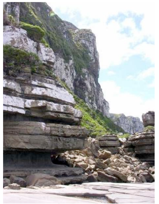
Purakanui Bay, Catlins.

sand from Sandfly Bay is (e.g., deposited atop 320 m Sandymount, or forms extensive sand plains at Okia Flat and Allans Beach). The semisaline Tomahawk Lagoon, as well as Hoopers and Papanui Inlets are notable because of their intactness and botanical communities. There is one endemic, the Cape Saunder's rock (Helichrysum daisy selago var. tumidum) only found on the Peninsula. Several threatened plant species are including most of known. the remaining mainland populations of Cook's scurvy grass. Many other species have become extinct in the past 100 years making it an obvious site for ecological restoration projects (of which there are already several).