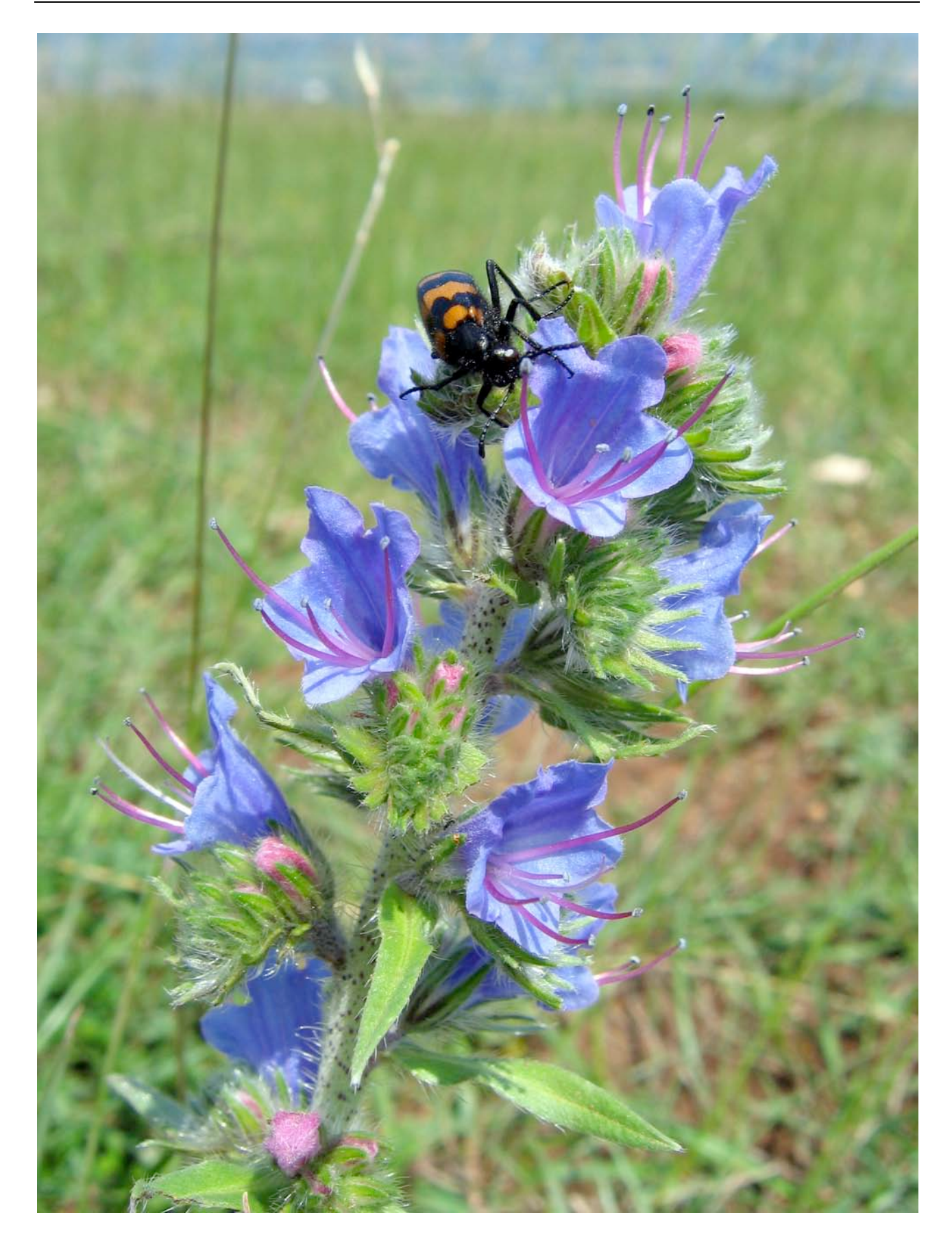
Beetle foraging on Echium vulgare .