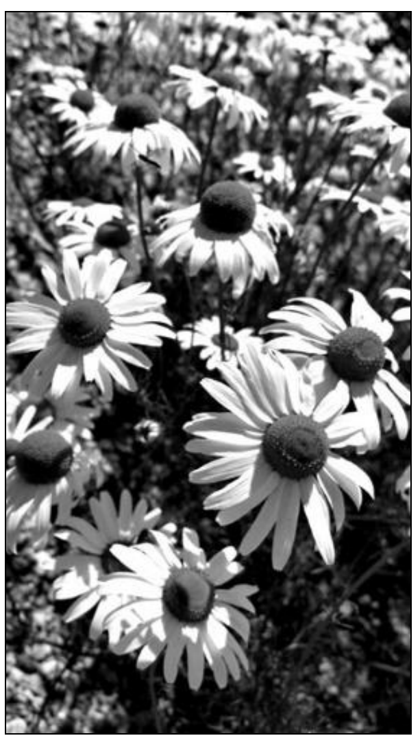
Black-and-white daisies