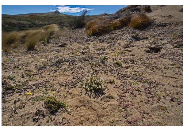
Gunnera hamiltonii

Directly above the beach was an area of coastal turf exposed to salt spray. Included amongst the plants growing there were Selliera radicans. Crassula moschata. Plantago raoulii, Leptinella dioica, Samolus repens and Apium prostratum all which grow on similar turfs around Dunedin. In addition to these species, the turf contained hundreds of plants of Gentianella saxosa in flower turning the whole hillside into a remarkable carpet of white. The uncommon coastal species Leptinella traillii, Myosotis pygmaea and Mazus arenarius were also present. Leptinella traillii is another southern coastal endemic found on both sides of Foveaux Strait.