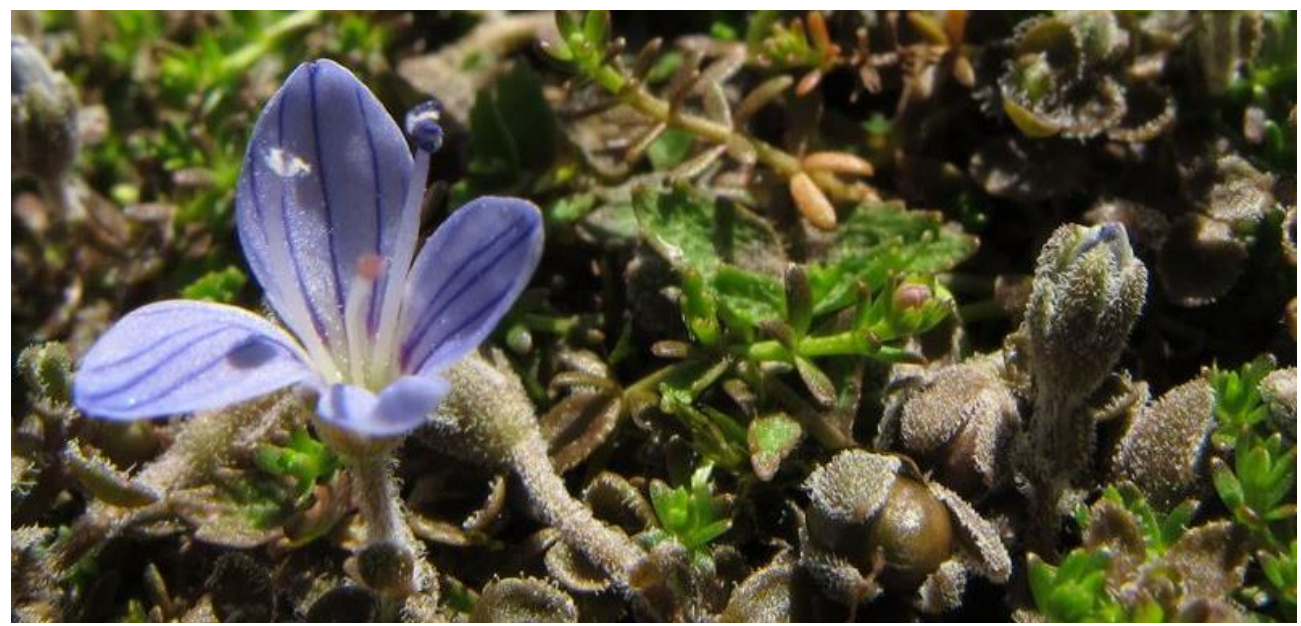
Parahebe canescens