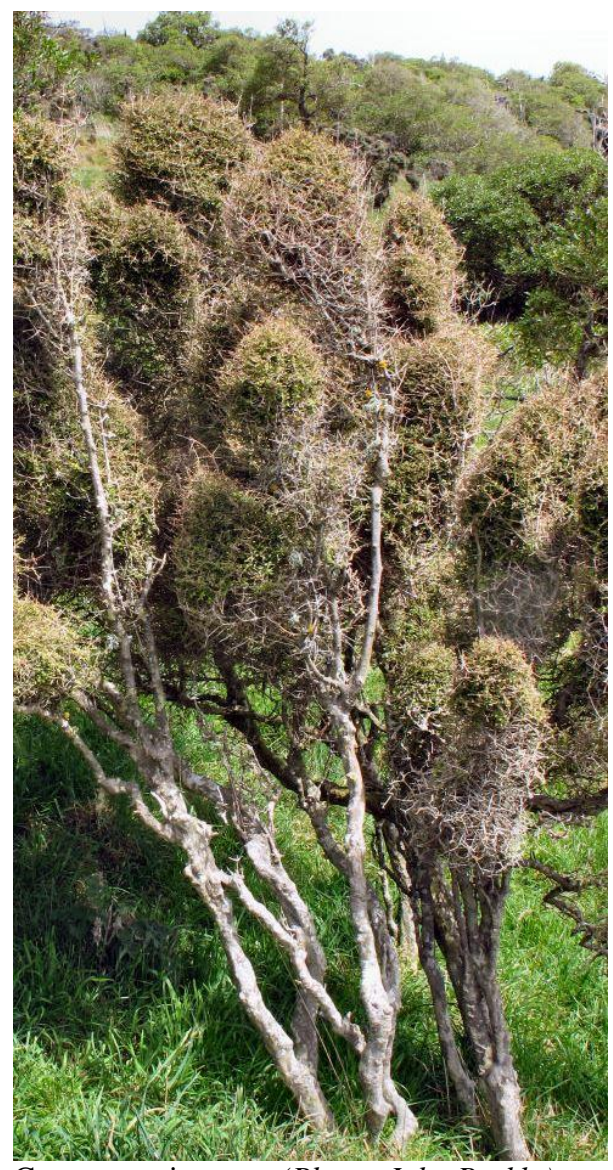
Coprosma virescens