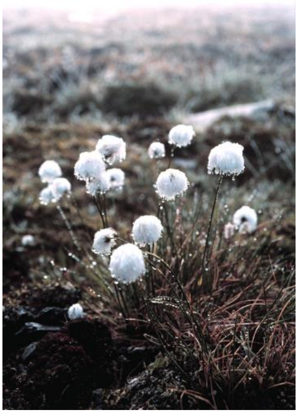
Eriophorum sp., cotton grass