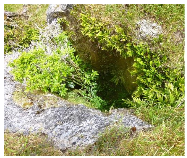
A 7m deep sinkhole

richness, and distributions? Well, this is a particularly important question especially when investigating habitat suitability for rare species, whether it is species management in situ (i.e. on-site) or ex situ (i.e. not on-site, like a translocation). Of course, just because a species historically inhabited an area does not mean that it would find the same location suitable today; habitat is heterogeneous spatially and temporally (Osborne & Seddon 2012). Understanding how a species may have adapted to change in relation to present extremely dav localities is important populations may nonetheless as benefitted from, were unaffected by, or responded negatively, to such changes. However, habitat suitability for many rare species remains unknown. Fortunately, identification of plant material in sub-fossil sites (along with palaeo-climatic modelling, descriptions of local diversity etc.,) has indicated that some regions