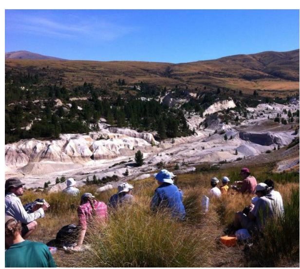
Lunch spot above Grey Lake

identifications. He would point out characteristics like serrated margins, venation patterns and cuticle thickness of different leaves. Thanks to his help I was fairly certain that one of my fossils came from a species within the genus Metrosideros .