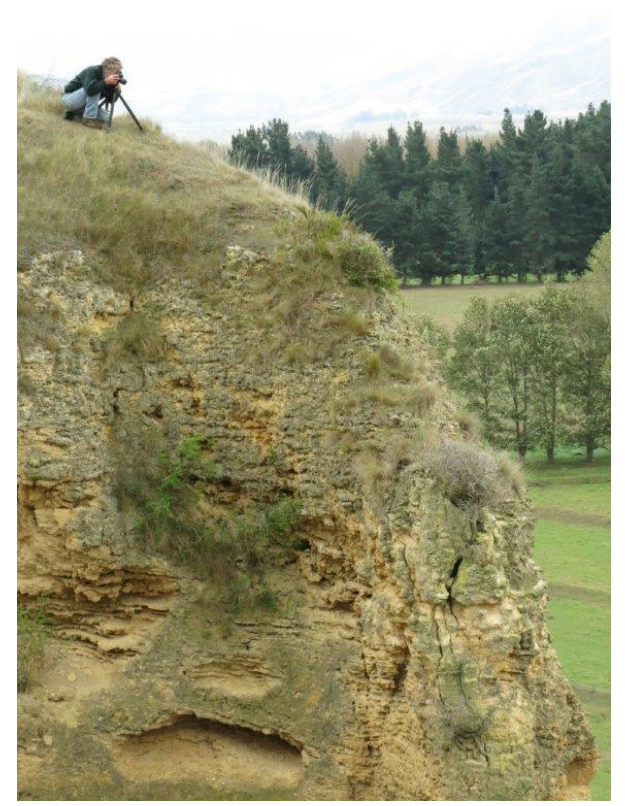
David photographing Carmichaelia hollowayi

Then it was down to the steep escarpment edge to see the Nationally Critical broom, Carmichaelia hollowayi, at least one of which still had seed pods. The "original" plants here have been supplemented with nursery raised ones that were planted out several years ago. Surprisingly, given the semi-arid conditions, survivorship has been high and many were bursting out of their protective wire cages. Next up were a couple of shrubs of Sophora prostrata before we reached a spur with Lepidium sisymbrioides, Plantago spathulata and Chaerophyllum novae-zelandiae. Further on we looked across at a very steep slope where two plants of a very rare Gentianella could be seen flowering. Its taxonomic status is unclear and it may differ from Gentianella calcis that occur on other limestone outcrops in the valley. We dropped back down to the vehicles for lunch, some electing to drag cut boxthorn down with them. Then it was back up to the north end of the reserve where the base of a lone kowhai (Sophora microphylla), protected by rabbit fencing, got some weeding to prevent smothering of the numerous seedlings beneath its canopy. Others wandered the nearby terrace riser