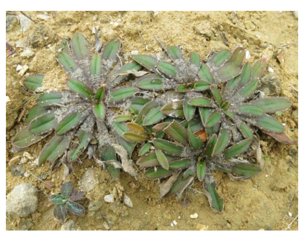
Plantago spathulata

Then it was down to the steep escarpment edge to see the Nationally Critical broom, Carmichaelia hollowayi, at least one of which still had seed pods. The "original" plants here have been supplemented with nursery raised ones that were planted out several years ago. Surprisingly, given the semi-arid conditions, survivorship has been high and many were bursting out of their protective wire cages. Next up were a couple of shrubs of Sophora prostrata before we reached a spur with Lepidium sisymbrioides, Plantago spathulata and Chaerophyllum novae-zelandiae. Further on we looked across at a very steep slope where two plants of a very rare Gentianella could be seen flowering. Its taxonomic status is unclear and it may differ from Gentianella calcis that occur on other limestone outcrops in the valley. We dropped back down to the vehicles for lunch, some electing to drag cut boxthorn down with them. Then it was back up to the north end of the reserve where the base of a lone kowhai (Sophora microphylla), protected by rabbit fencing, got some weeding to prevent smothering of the numerous seedlings beneath its canopy. Others wandered the nearby terrace riser