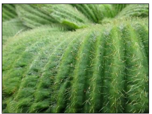
Pleurophyllum speciosum