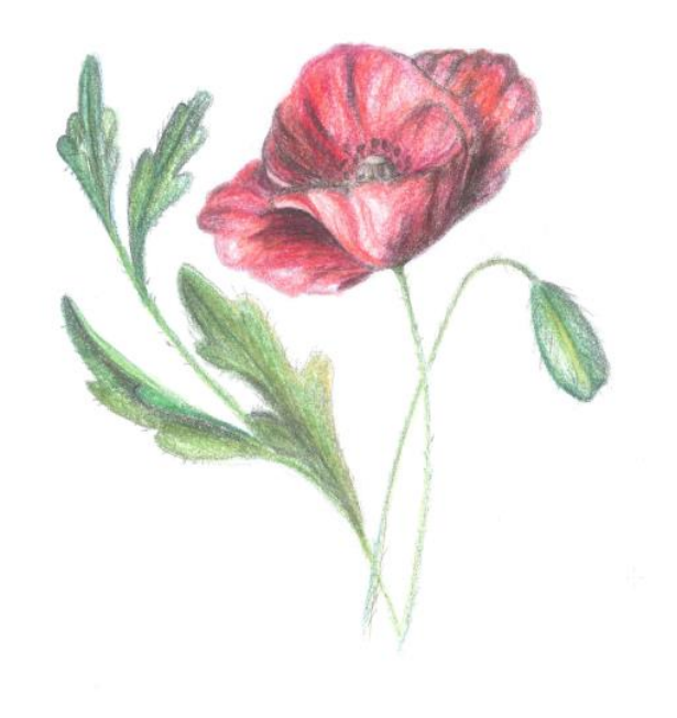
Papaver rhoeas (Tegan Lamont)

habitat provided for it if it is to persist. Maybe it's time to conserve some of our introduced weeds as they also have a part to play in our lives.