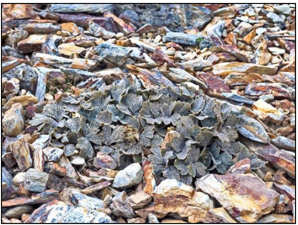
Ranunculus crithmifolius