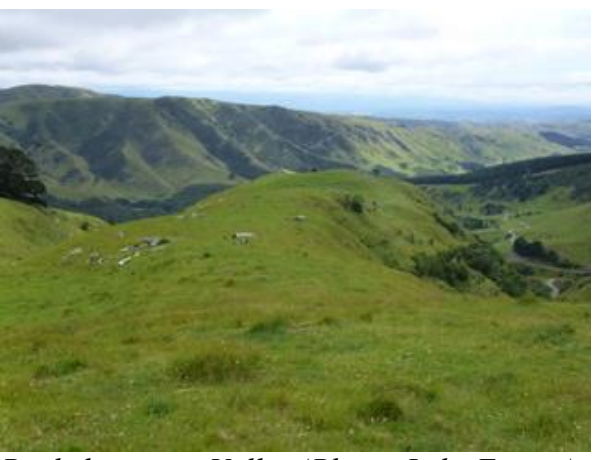
Ruakokopatuna Valley

richness, and distributions? Well, this is a particularly important question especially when investigating habitat suitability for rare species, whether it is species management in situ (i.e. on-site) or ex situ (i.e. not on-site, like a translocation). Of course, just because a species historically inhabited an area does not mean that it would find the same location suitable today; habitat is heterogeneous spatially and temporally (Osborne & Seddon 2012). Understanding how a species may have adapted to change in relation to present extremely dav localities is important populations may nonetheless as benefitted from, were unaffected by, or responded negatively, to such changes. However, habitat suitability for many rare species remains unknown. Fortunately, identification of plant material in sub-fossil sites (along with palaeo-climatic modelling, descriptions of local diversity etc.,) has indicated that some regions