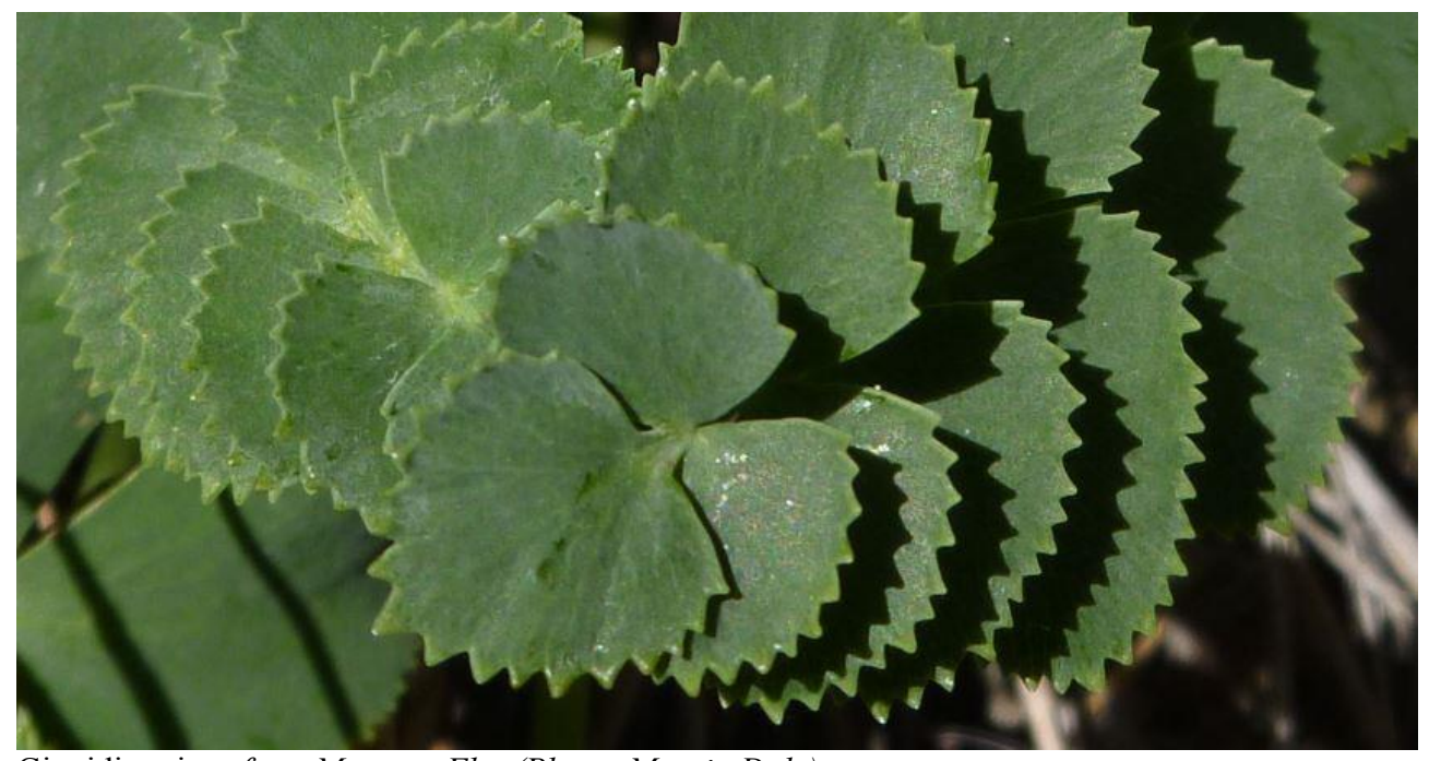
Gingidia grisea from Macraes Flat