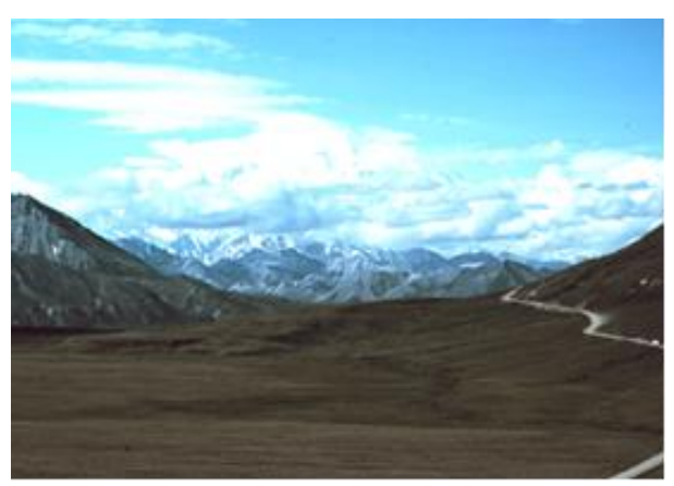
Cloud-covered mountain

Then we got on to research, international collaborations across the Arctic made especially easy to understand by the acronyms: AMAP (comprising ACA and SWIPA) CAFF (comprising ABA and PAF) and ITEX. And no, AMAP doesn't make maps and CAFF doesn't involve coffee breaks. Well, not only coffee breaks.