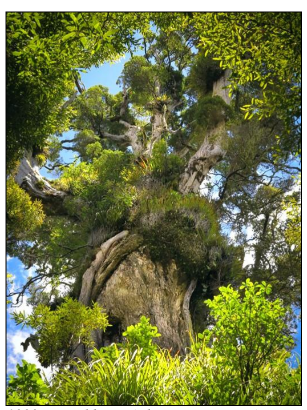
1000-year old rata