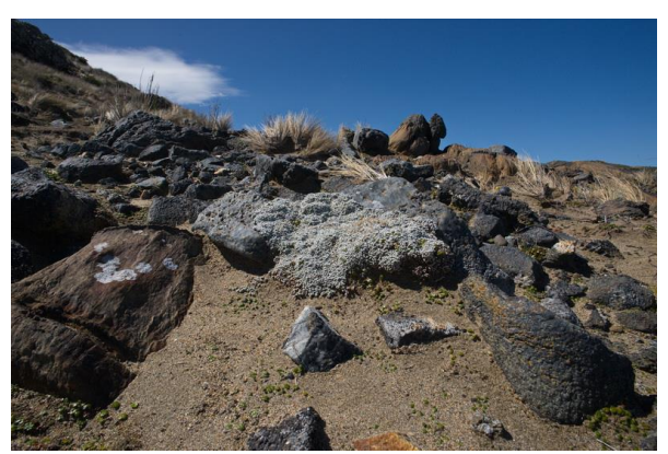
Raoulia hookeri

Towards the crest of the dunes the specialised native sand binding sedge, Ficinia spiralis , is still present and holding its own in face of competition with introduced marram grass ( Ammophila arenaria ). Another specialised