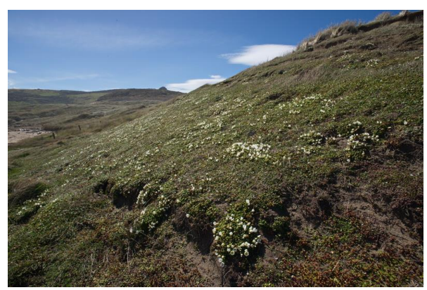
Gentianella saxosa

The Omaui/Three Sisters dune complex, though modified by exotics, still contains a significant proportion of native indigenous dune species. Most coastal ecosystems in Otago and Southland are now highly modified and are dominated by introduced species such as European marram (Ammophila arenaria) North American lupin and (Lupinus arboreus). The Omaui/Three Sisters area is unique in several respects; it retains much of the original coastal diversity, there is a significant alpine element growing at sea level and there are several local endemic species present.