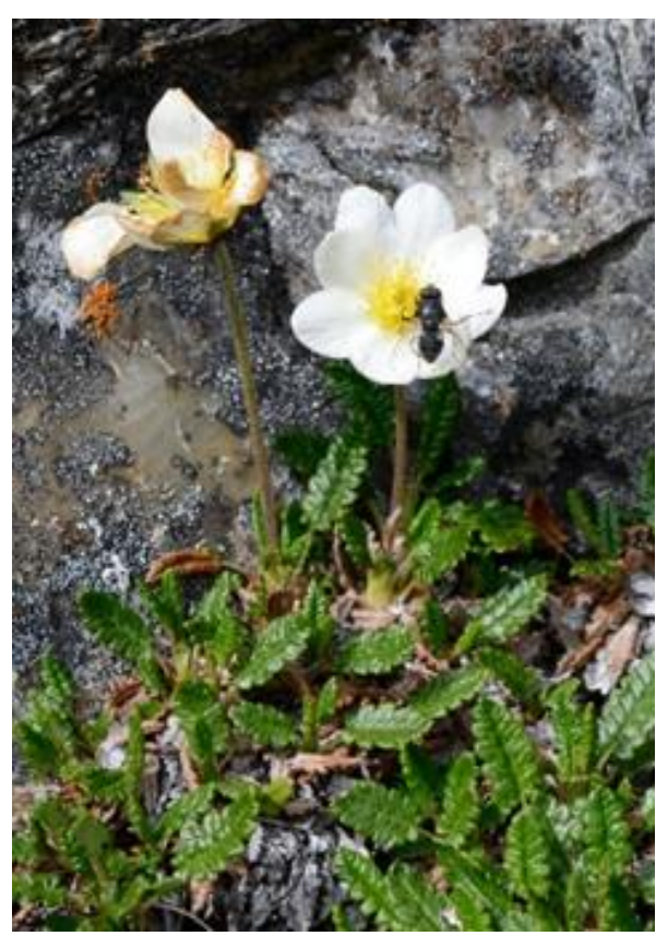
Dryas octopetala