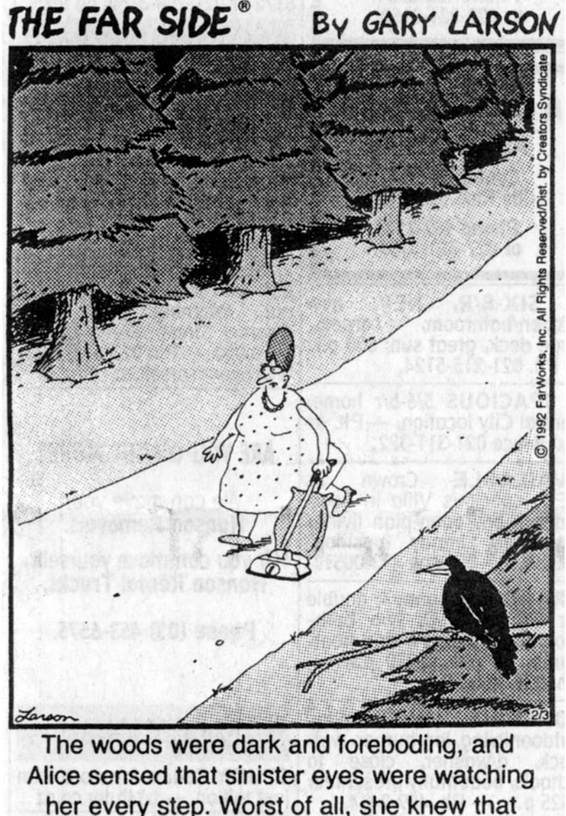
Nature abhorred a vacuum.

The Far Side , by Gary Larsen. ODT 12 Feb 2007 , p 31